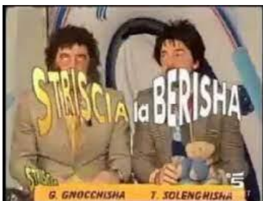
Fig. 4: Technology and populism have long been linked: The example of TV.

As early as 1977, speaking about Gramsci at a Conference held at the Polytechnic of Central London, the historian Eric Hobsbawm declared that 'for a variety of reasons [...] Italy is a sort of laboratory of political experiences'. 82 Such a statement could not be more up to date when it comes to the political use of social media and digital platforms. Indeed, this was a trend in Italy well before becoming a global one. In the US, it was not until 2008 that the internet played an unprecedented role in national elections, when Obama used the web to get funding for his political campaign. In Italy, politics started to address citizens through digital channels as early as 2005. At that time, Beppe Grillo, the leader of the Five Star Movement (M5S), used its blog to attract citizens, making the interest generated by ordinary citizens in online discussions about politics comparable and even a challenge to that of national television and resulting in this blog being rated by The Guardian among the most powerful web logs in 2005. 83 At the time, Grillo was among the first to combine online and physical campaigns, captivating and organising a growing number of people through his blog protesting against Italian politicians. 84