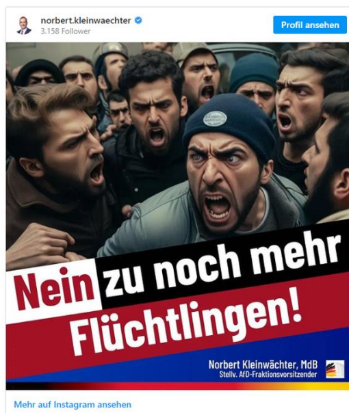
Fig. 3: Deep fakes posted by AfD politicians

Despite its modest size in Germany, the AfD has been remarkably successful on Facebook. Data from a diverse panel of 473 German users shows that the AfD gained tremendous traction on Facebook in the run-up to the 2021 elections, with AfD posts on those pages appearing in the participating Facebook users’ news feeds at least three times as often as those from any rival party. 73 The users who did see content from the AfD tended to see it repeatedly, and, according to the data, the AfD was especially good at reaching its own supporters. The AfD’s dominance of the panellists’ news feeds is especially telling considering that the underlying panel in Germany, organised by Citizen Browser, consisted of more people who identify themselves as SPD and CDU/CSU supporters. Those who did report aligning with the AfD received an average of 55 posts from AfD-related pages in their news feeds in the eight weeks in which data was collected for this research project. By comparison, supporters of the CDU/CSU received an average of just six CDU/CSU-affiliated posts in their feeds.